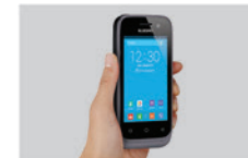
4 inch touch screen

When it comes to touch mobile computer that fits in your pocket, the EF400 is the best. Standing alone as industrial leader to have been validated and accepted on mobile computers, the EF400 is crafted to be the ultimate touch mobile computer for your successful business.